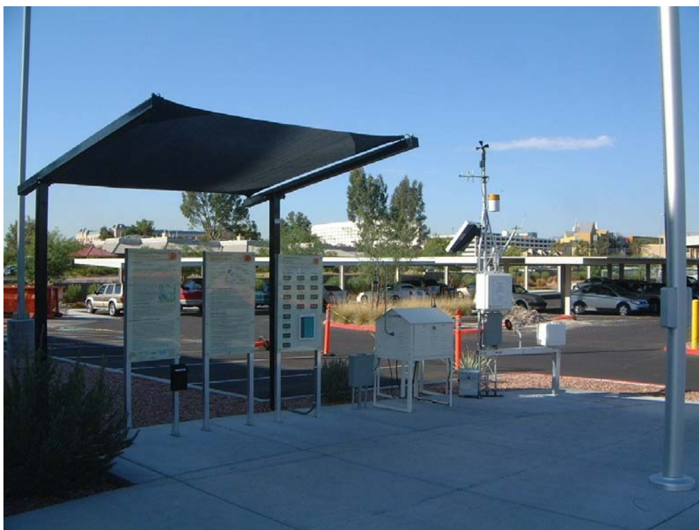
Figure 4. Interpretive signage associated with the CEMP station in Las Vegas, Nevada.

DRI also has developed mobile monitoring platforms, including both tripod-mounted systems deployable in approximately one hour, and trailer-mounted platforms that can be moved easily between road-accessible locations (Fig. 5). The mobile stations (minus the particulate sampler) can be operated entirely on solar power in conjunction with a deep-cell battery, and include all meteorological sensors and a PIC for detecting background gamma radiation. They can easily be fitted with additional instrumentation depending on the needs of the user.