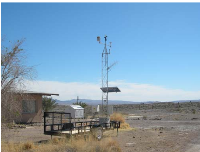
Figure 5. A CEMP mobile trailer-mounted monitoring station near Tecopa, California.

The enhancements that the CEMP has undergone over the past 7 years have resulted in the evolution of a platform that is very well suited for use as an in-field multi-environment test-bed for prototype environmental sensors and in interfacing with other scientific and educational programs. Recent and near-future collaborators have included federal, state, and local agencies in