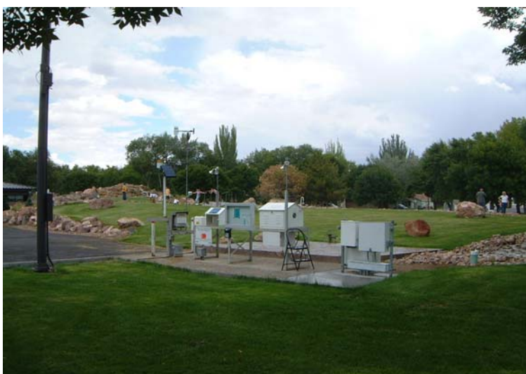
Fig. 2. A view of the CEMP monitoring station in Delta, Utah.

During the transition process, DRI added a full suite of meteorological sensors at each station to measure air temperature, humidity, wind speed and direction, incident solar radiation, barometric pressure, and precipitation (Fig. 2). Prior to the addition of this equipment there were very few direct meteorological data available in the region to the north and northeast of the NTS. Through