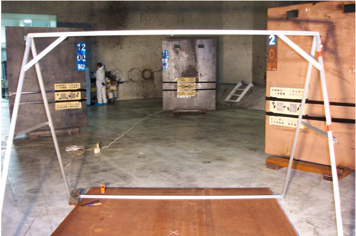
Figure 2. Placement of sample holder on steel blast shields inside the confined firing facility. The aluminum from in photo was used to suspend mock RDD 1 m above the floor.

arrays contained several of each form (wet,dry,grimed etc.) of laboratory prepared samples as well as field collected and analysis specific (e.g. elipsometry) prepared media. The sample arrays were affixed to the blast shields with metal bands. The vertical sample surfaces were arranged to maximize exposure to the mock RDD. Floor sample arrays that contained similar samples placed behind the blast shields and attached to 1m x 1m x 5cm (4'x 4'x 2") steel plates to assess horizontally deposited "fallout" Cs compared to explosively deposited Cs. Sample placement in the chamber is shown below (Figure 2).