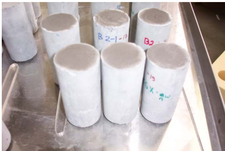
Figure 1. Examples of concrete cores placed in CFF chamber.