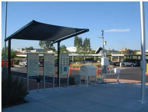
Figure 2. A CEMP station on the campus of the Desert Research Institute in Las Vegas, Nevada.

Over the past seven years, DRI has upgraded stations to enhance their technical capability as well as improve their service to the public. Since 2000, the stations have been equipped with a full suite of meteorological equipment to measure air temperature, soil temperature, humidity, wind speed and direction, incident solar radiation, barometric pressure, and precipitation (Fig. 2). The meteorological instruments allow for a better analysis of variations in radiological measurements as a function of weather events. Examples include mini-“fallout” events from precipitation, and changes in natural radon and thoron emissions with barometric changes. Radon and thoron contribute to PIC measurements from the gamma decay of daughter products [1].