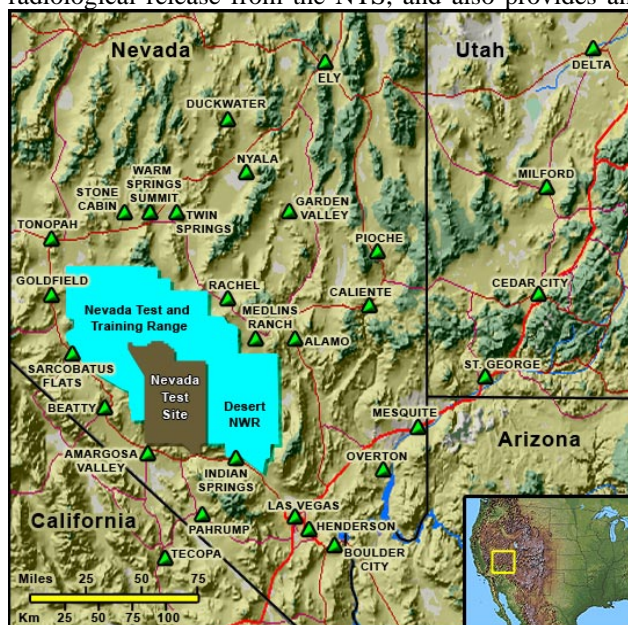
Figure 1. Locations of CEMP network stations. From the CEMP web site home page at http://cemp.dri.edu .

Since assuming administration of the program in 2000, DRI has accomplished significant enhancements to the network's data collection and transmission capabilities. A robust datalogging and communications system allows for the near real-time transmission of data to a platform maintained by DRI's Western Regional Climate Center (WRCC), where the data are uploaded and displayed on a publicly accessible web site ( http://cemp.dri.edu ). Additionally, the CEMP can serve as part of an emergency response network in the event of an unplanned radiological release from the NTS, and also provides an