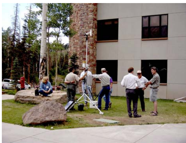
Figure 4. Community members receive training on the operation of a mobile CEMP station at an annual workshop in Brian Head, Utah.

While the development of a public web site has been very important in increasing transparency and accessibility to the monitoring data, public involvement in the CEMP goes far beyond simple accessibility to the data. DRI employs local citizens, most of them high school science teachers, whose responsibilities include ensuring that the equipment is operating normally and collecting air filters and routing them to DRI for laboratory analysis [3]. These Community Environmental Monitors (CEMs) are available to discuss the monitoring results with the public, to participate in formal presentations to community and school groups, and in general serve as a focal point for DRI and NNSA/NSO for identifying environmental concerns in their communities. CEMs also participate in annual workshops organized by DRI and NNSA/NSO (Fig. 4). The workshops enable them to participate more fully in public education forums, and to better answer questions from the local communities about the monitoring program and data results in their area and throughout the network. Workshops include presentations on the “ABC’s of Radiation,” hands-on exercises targeting equipment maintenance and minor troubleshooting issues, and a valuable exchange of ideas, concerns, and suggestions among all the program participants.