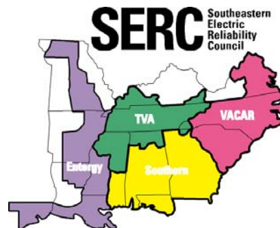
Southeastern Electric Reliability Council (SERC) Regional Power Pool