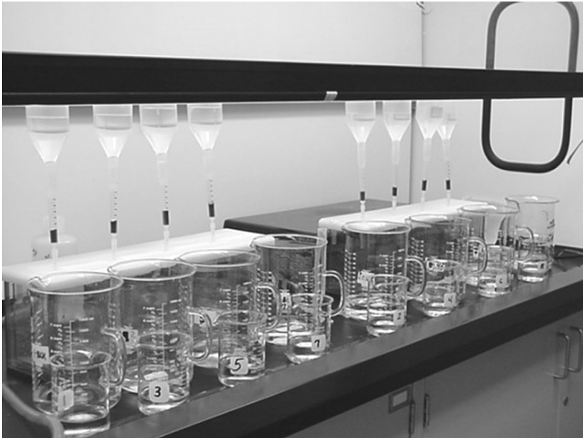
Figure 1 Vacuum Box System with MnO 2 Resin Columns