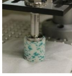
Figure 1. Coaxial probe measurement of an LX-10 explosive pellet.

Calibration was performed using deionized water as a reference. Because of the large dielectric mismatch between water and the explosives in the frequency range 5-20 GHz, results obtained for explosives were further normalized to the ratio of the known to measured \epsilon_r value for Teflon, 2.1/1.5 = 1.4 . Measured \epsilon_r values for Teflon and explosives were somewhat constant in the frequency range 5-20 GHz, generally decreasing 10-20% over the measurement range. Calculated \epsilon_r at 10 GHz are shown in Table 1 for three HMX-based explosives, LX-04, LX-14, and LX-10. Pressed ultra-fine TATB (no binder) is also shown as a reference. Calculated \epsilon_r for explosives at 100% theoretical maximum density (TMD) were determined using the Maxwell-Garnett mixing formula,