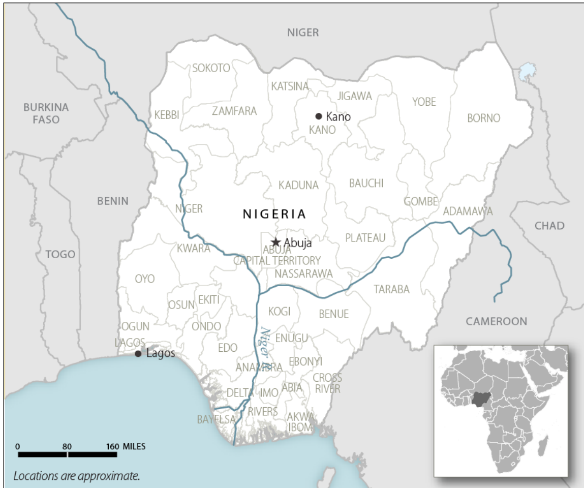
Figure I. Nigeria at a Glance

Recent protests in the Ibo-dominated Southeast have raised concerns about a resurgent separatist sentiment among some Ibo, who argue that they have also been marginalized by the government. From 1967 to 1970, the region suffered a deadly civil war as secessionists fought unsuccessfully to establish an independent Republic of Biafra. The recent protests, which began in October 2015, have led to clashes with security forces. Economic frustration is reportedly widespread in the region, but by many accounts the majority of Ibo would not support insurrection.