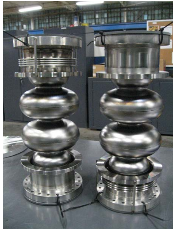
Figure 3. 1500 MHz two two-cell niobium cavities with SS helium vessel end spoils.

It was decided to use the innovative but unproven concept of using a coupled two-cell cavity for passive operation in a high current storage ring [7]. Since there are N modes in an N-cell coupled system, the difficulty is in the control of the second mode for the coupled two-cell cavities. To first order the mode separation of the zero and pi modes is a function only of the cell-to-cell coupling. By careful cavity design and independent tuning of the zero and Pi mode in the cavities, we have been able to tune the desired \pi -mode from minimum to design (1MV) excitation while keeping the unwanted zero mode safely between beam revolution lines without excitation. The two-cell cavity is shown in Figure 3.