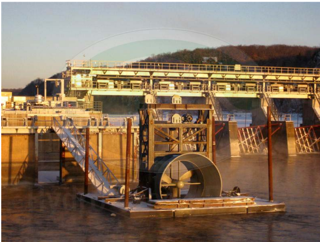
Figure 1. Photographs of the Hydro Green Energy LLC horizontal axis turbine installed at the Mississippi Lock and Dam No. 2 hydroelectric project, Hastings, Minnesota.