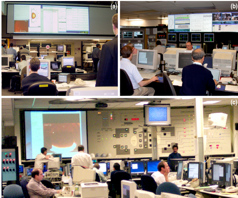
Fig. 2. The control rooms of NSTX (a), DIII-D (b), and C-Mod (c) with shared display walls being used to enhance collaboration. On the DIII-D display is also video from remote collaborators in Europe who were participating in that days experiments.

drawbacks including platform dependencies, limited sharing modes and session initiation difficulties that don't readily lend themselves to the task. To overcome these disadvantages the NFC project has developed and deployed tools that allow for display-sharing and multi-user interaction.