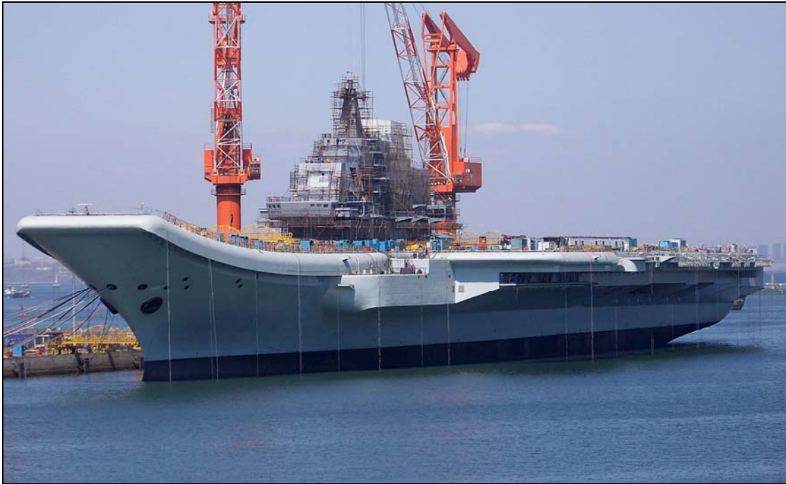
Figure 5. Ex-Ukrainian Carrier Varyag Being Completed at Shipyard in Dalian, China