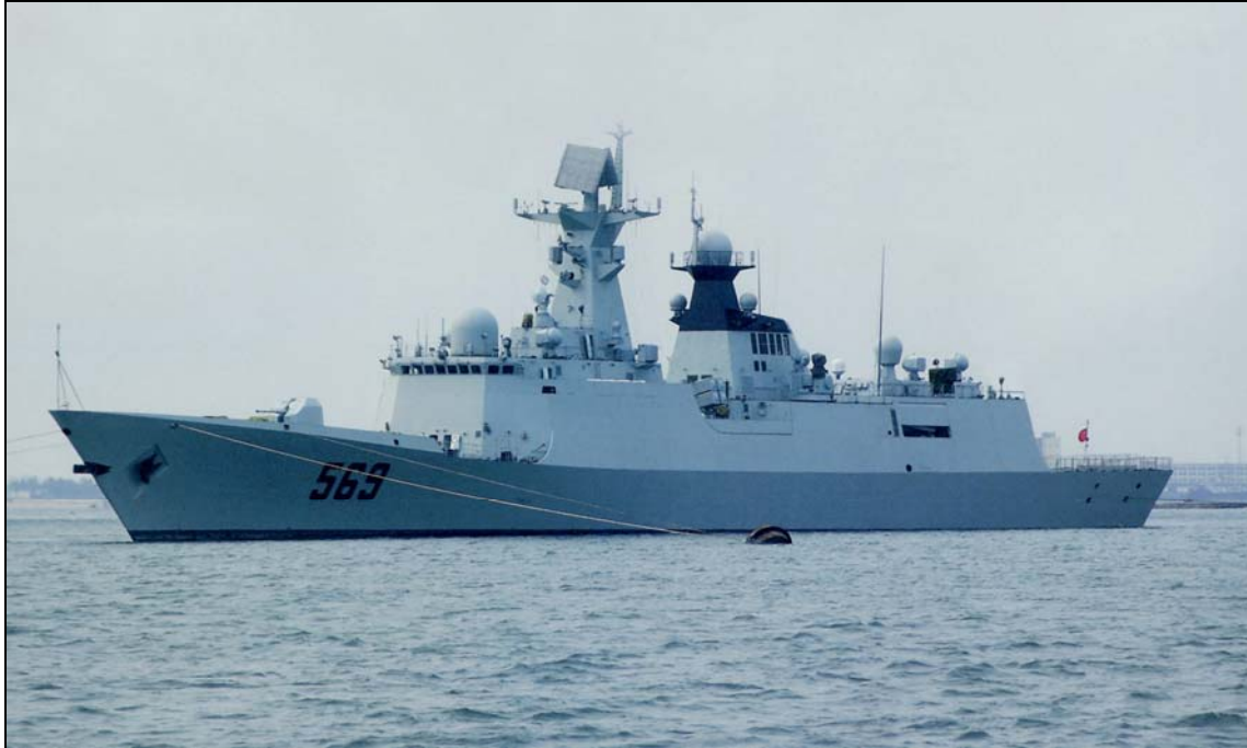
Figure 7. Jiangkai II (Type 054A) Class Frigate