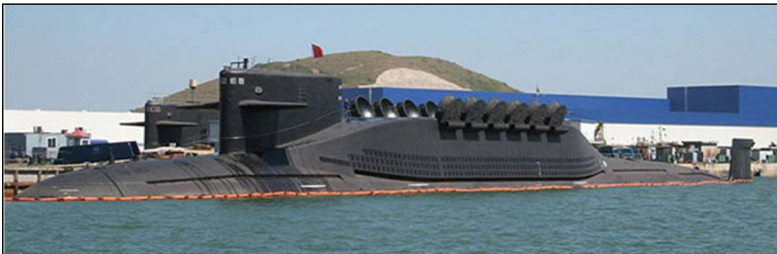
Figure 1. Jin (Type 094) Class Ballistic Missile Submarine