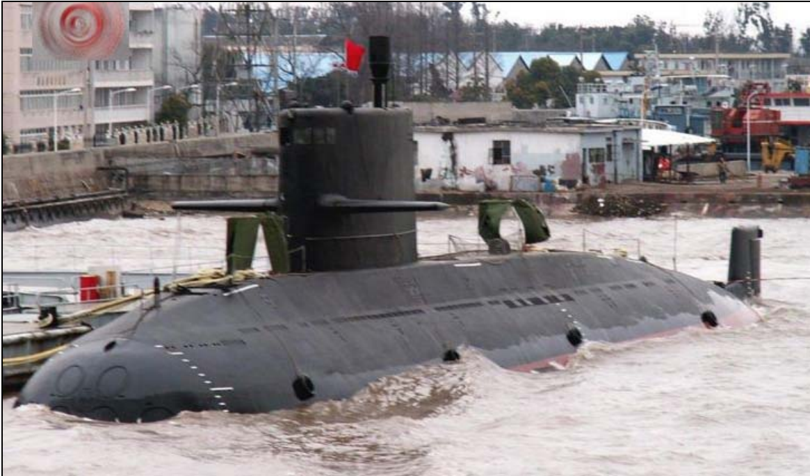
Figure 2. Yuan (Type 041) Class Attack Submarine

Source: Photograph provided to CRS by Navy Office of Legislative Affairs, December 2010.