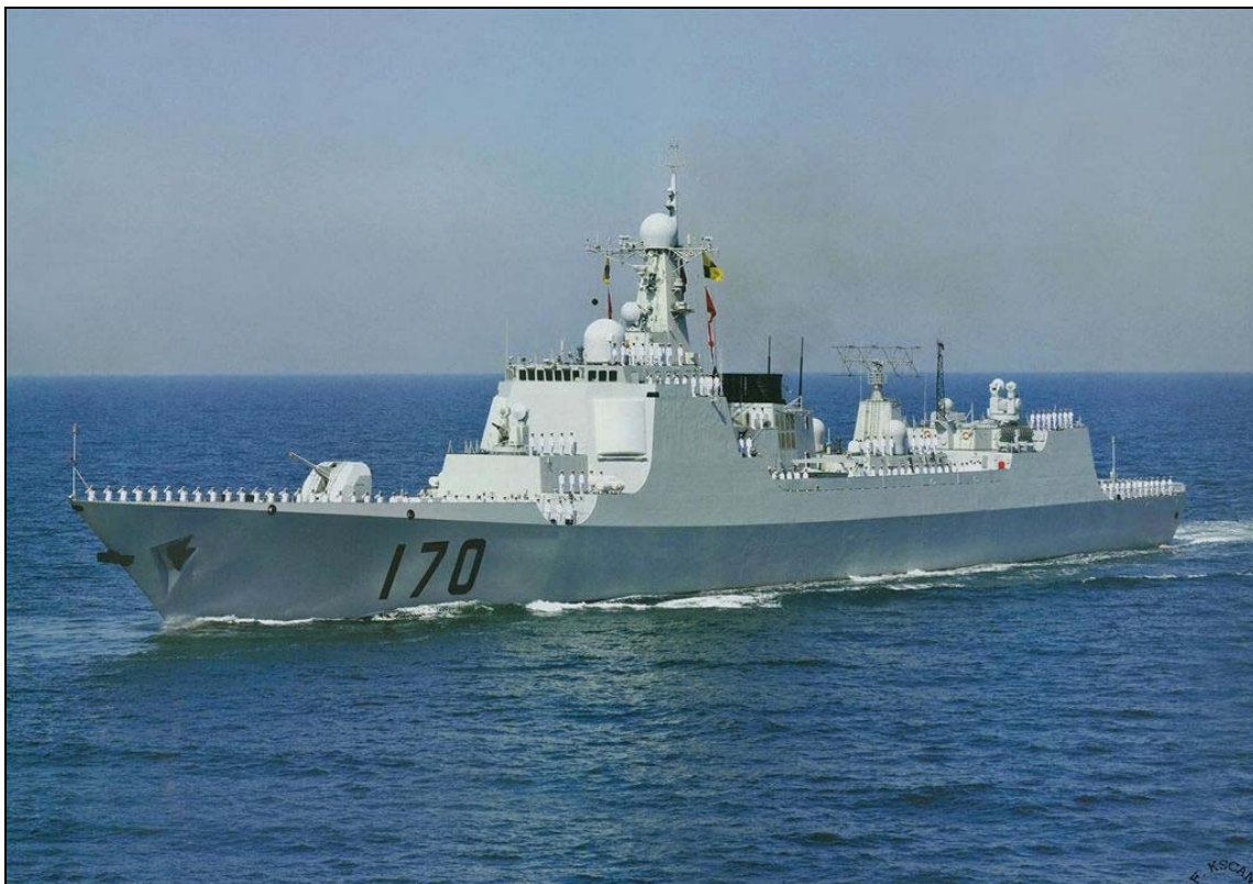
Figure 6. Luyang II (Type 052C) Class Destroyer