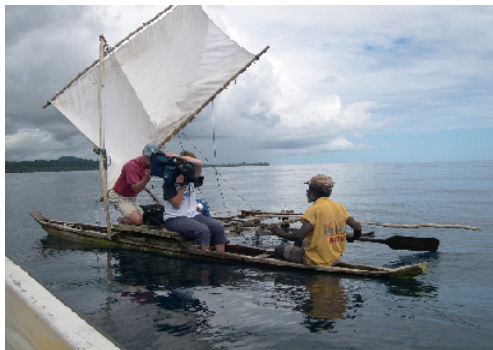
Trade Wind Communications films for the TWP kiosk.

TWP Kiosk: Filmed in August 2003, the kiosk features interviews with community elders and government officials from Manus, Papua New Guinea; Republic of Nauru; and Darwin, Australia. The kiosk documents traditional knowledge of the environment and observations of climate change in the Pacific communities.