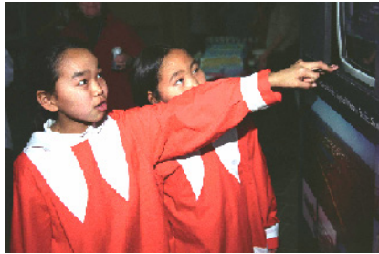
Students view NSA kiosk at the Iñupiat Heritage Center

NSA Kiosk: Permanently on display at the Iñupiat Heritage Center in Barrow, Alaska, the kiosk is a public awareness tool about climate change science and impacts on the North Slope of Alaska.