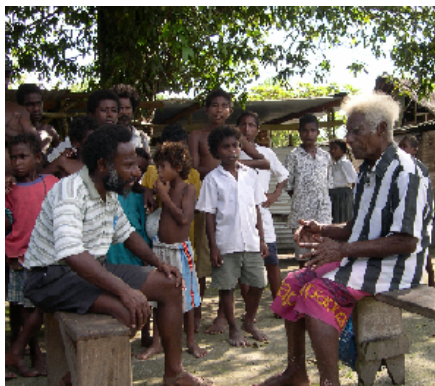
Community leaders from Manus Island are pictured above discussing climate change impacts on Pacific islands. Adults and children from surrounding villages gather to listen.

The U.S. Department of Energy's ACRF supports education and outreach efforts for communities and schools located near its sites. ACRF Education and Outreach has developed interactive kiosks at the request of the communities to provide an opportunity for the public to learn about climate change from both scientific and indigenous perspectives. Kiosks include interviews with ARM scientists and provide users with basic information about climate change studies as well as interviews with elders and community leaders discussing the impacts of climate change on land, sea, and other aspects of village life.