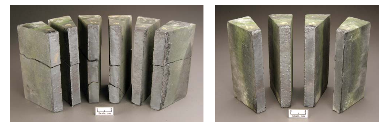
Figure 1. Refractory brick following exposure in the rotary kiln test. To the left are commercially-produced high chromia refractories; to the right are the ARC-ANH developed refractories.

While not currently an issue, there is some concern that the future use and disposal of chrome-bearing materials will be subject to more-stringent environmental regulations. The Albany Research Center is also looking to this future by beginning the development of a non-chrome based refractory material that will have the requisite stability for long service life in a