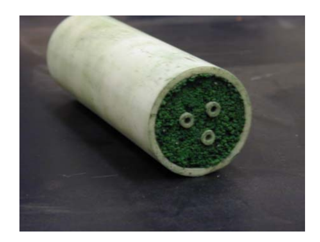
Figure 3. ARC-engineered thermocouple protection system for gasifier systems.

thermocouple assembly will be tested in the laboratory to confirm its relative resistance to slag penetration and attack. After the laboratory exposure tests are completed, fully instrumented prototypes will be produced in collaboration with our partner thermocouple manufacturers, for testing in commercial gasifiers.