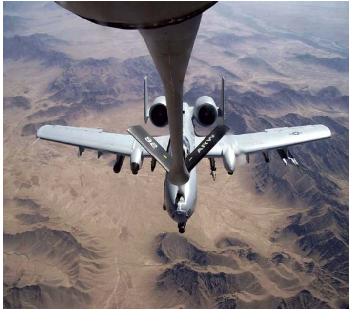
Figure 1. Photo of “Boom” Air Refueling

Boom vs. Probe and Drogue Air Refueling. Receiver aircraft can be equipped to refuel from a boom (most Air Force aircraft) or with a probe and drogue (most Navy, Marine Corps, and allied aircraft). Operational planners must ensure tasked tankers are equipped to connect with their scheduled receiver. 23 Figure 1 contains an example of “boom” air refueling.