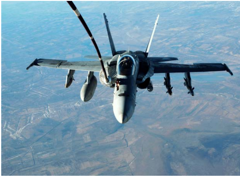
Figure 2. Photo of “Hose and Drogue” Air Refueling