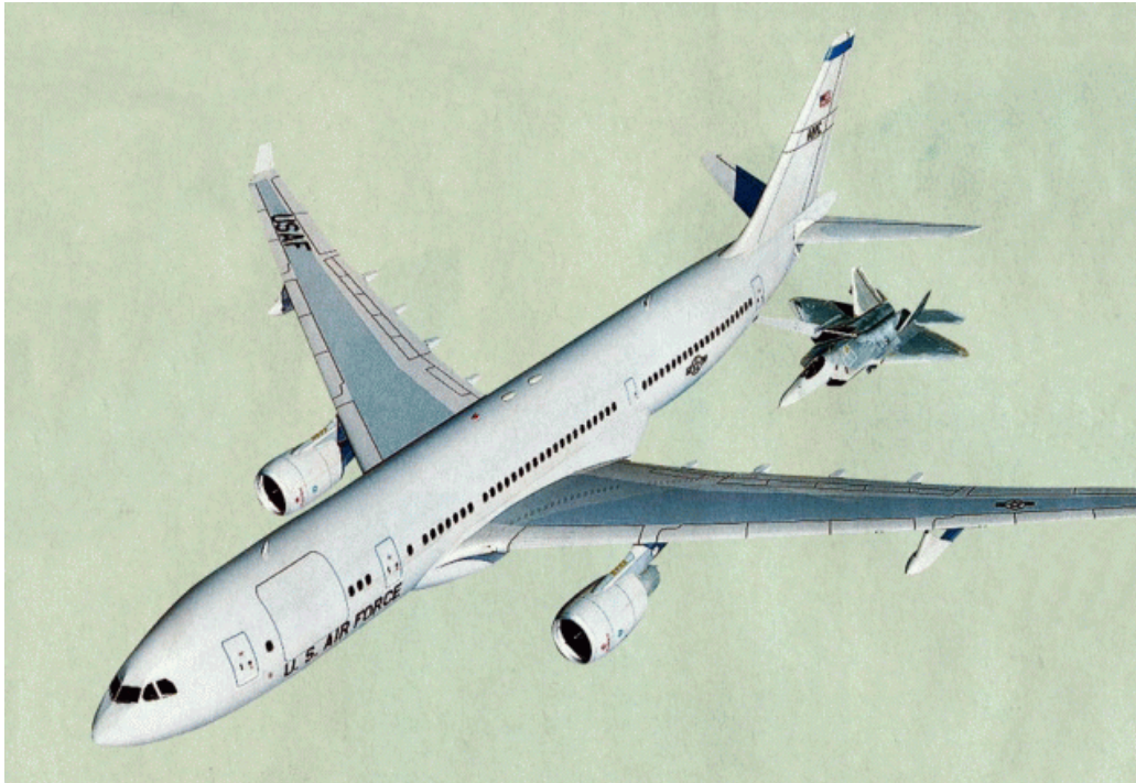
Figure 7. Artist Impression of KC-30