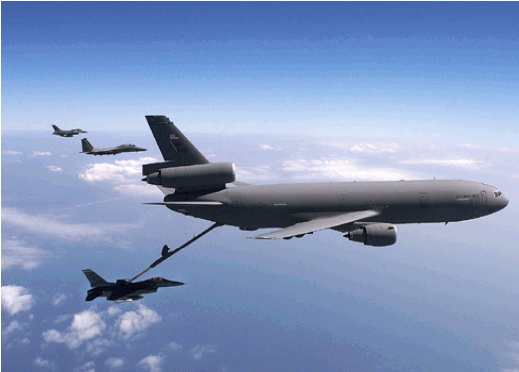
Figure 5. KC-10 Refueling Air Force Fighters