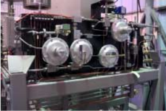
Fig. 3 Gas panel containing pneumatic.

damage was extensive, a spare panel could be installed while repairs on the primary panel continued.