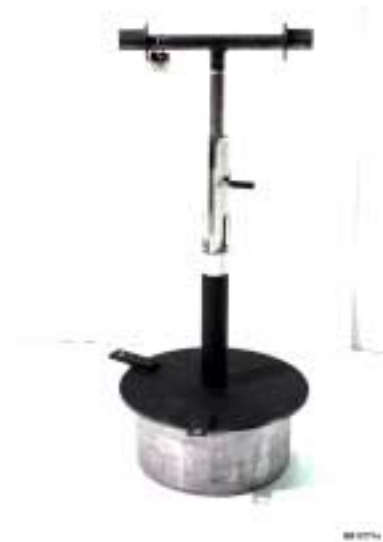
Fig. 6 Lifting handle used to remove the thermal barrier and the furnace.

Various designs were evaluated for the canister that would be used to contain powders during HIPing. If a container or a weld on the container failed during processing, the container might expand. If the expansion was sufficient, the canister could damage the furnace elements requiring the installation of a new furnace. As an additional measure of protection, an expansion cage was designed and fabricated (see Fig. 7). This cage was made of mild steel. The sides utilized perforated steel, allowing gas flow. An expansion cage was used in all HIP cycles.