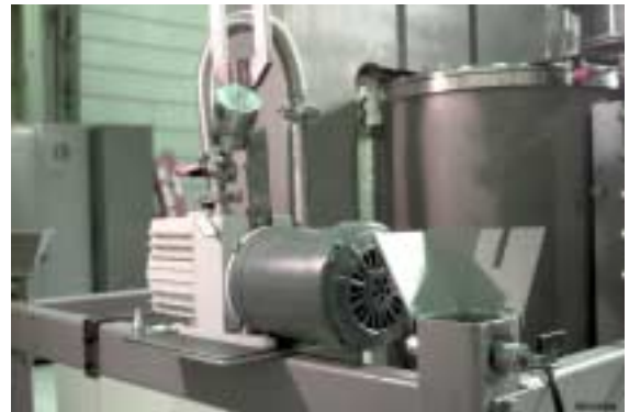
Fig. 2 Vacuum pump after modifications.

The vacuum pump was located in the left rear of the HIP. Because a vacuum pump is a component that is likely to fail, it was raised to allow easier access. The bolts that secured the pump in place were removed, and tapered pins were used. These kept the pump from moving side-to-side while the weight of the pump held it down. A lifting fixture was added and the pump could now be positioned onto the pins with an overhead crane as shown in Fig. 2.