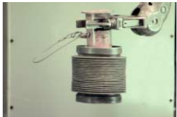
Fig. 10 The first demonstration scale canisters, loaded with irradiated material, processed at ANL-W.

Based on the 7-day Product Consistency Test (PCT) results, the durability of the radioactive CWF is comparable to good high-level waste glass and is much better than the reference EA glass [5].