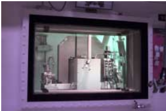
Fig. 9 ANL-West HIP installed in the HFEF “Hot Cell.”

an air atmosphere. A series of rapid venting tests were performed with the HIP in the decon cell. Additionally, these experiments supplied data used in a HIP depressurization analysis. In January 1999, the HIP was pressurized to 34 MPa (5000 psi) and then allowed to vent as quickly as possible. The decon cell pressure changed from approximately -0.62 in. w.g. to approximately -0.55 in. w.g. The next day, the HIP was pressurized to 103 MPa (15000 psi) and then allowed to vent as quickly as possible. The pressure in the decon cell changed from approximately -0.63 in. w.g. to approximately -0.52 in. w.g. With the data from these venting tests, the analysis concluded that the HIP would safely vent pressure and the cell would not become pressurized, even during a worst case scenario.