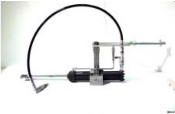
Fig. 4 Modified hydraulic ram used to move the yoke.

A large oval yoke, weighing almost 2 tons, is nearly one half of the total weight of the in-cell HIP components. The yoke, when centered over the pressure vessel, holds the top and bottom end plugs in place to maintain vessel pressure. The yoke is positioned by a hydraulic ram, located at the bottom of the yoke, near the floor. If the ram failed with the yoke centered over the end plugs, the contents of the vessel could not be removed until after the ram was repaired. To repair the ram, either the HIP would be transferred to a repair area or a manned entry would be required. If the HIP was loaded with a radioactive sample, it could not be transferred to the repair area and a man entry would be prohibited. Additionally, to move the HIP the yoke must be centered over the vessel to maintain the proper center of gravity. If the ram failed with a yoke not centered, the center of gravity would not be correct, preventing the HIP from being transferred. The ram was modified to allow remote removal and assembly. Changing the bolts to pins, adding quick-disconnect, and adding a lifting fixture (see Fig. 4) did this.