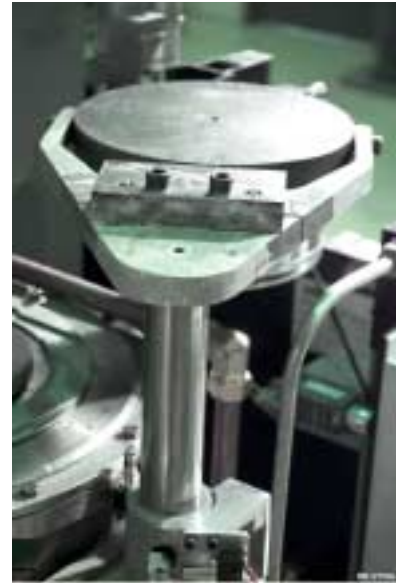
Fig. 5 Top end plug with modified mounting bracket.

The top end plug is a precision-machined plug equipped with pressure-sealing O-rings. The plug is located in the top of the pressure vessel and moves up for removal and down for insertion into the pressure vessel by means of a hydraulic ram. The frequent use wears out the O-ring, preventing the plug from sealing pressure, and requiring replacement. Remote changing of O-rings is possible, but due to location would be very awkward in this case. The plug was not altered, but the mounting fixture was modified, as shown in Fig. 5, so that the plug could be removed and taken to the repair area. A spare plug was purchased to allow for processing during maintenance of this item.