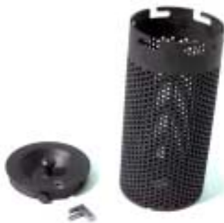
Fig. 7 Mild steel expansion cage used in the HIP to help protect the furnace.

Various designs were evaluated for the canister that would be used to contain powders during HIPing. If a container or a weld on the container failed during processing, the container might expand. If the expansion was sufficient, the canister could damage the furnace elements requiring the installation of a new furnace. As an additional measure of protection, an expansion cage was designed and fabricated (see Fig. 7). This cage was made of mild steel. The sides utilized perforated steel, allowing gas flow. An expansion cage was used in all HIP cycles.