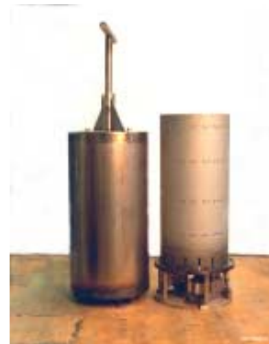
Fig. 1 Thermal barrier and furnace modified to include lifting fixtures.

Both the thermal barrier and the furnace, shown in Fig. 1, are inserted together into the pressure vessel for a HIP run. The thermal barrier slips over the furnace element and provides an insulated barrier between the furnace and the cooling jacket of the HIP. The thermal barrier was locked to the furnace by using a “keyhole.” This design had three studs protruding from the bottom of the thermal barrier. These were inserted into three keyholes on the furnace. When the furnace and the thermal barrier were to be removed together, the thermal barrier was rotated clock-wise. This trapped the studs in the narrow portion of the keyhole. With the studs trapped, the thermal barrier would be removed with the furnace secured inside. To load a sample into the furnace, the thermal barrier would be removed, leaving the furnace in the HIP. The sample would be loaded into the HIP and would rest in the furnace on a raised pedestal. If only the thermal barrier was to be removed, it was rotated counter-clockwise. This enabled the studs to clear the large opening of the keyhole. A new interface was developed to remove the thermal barrier and the furnace. A double J slotted interface was welded to the top of the thermal barrier. A T-Bar handle could be inserted into the slot. The handle could be manually rotated to the desired location.