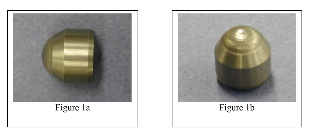
Figure 1. Two Views of the Round Top Drill Bit Insert. The insert is typical of the cutting tools placed on rotary drill bits. (Orientation of the fibrous monolith was right to left, from the round top to the flat base.)

During the last reporting period and continuing into this period, five TC inserts were manufactured. The round top inserts were nominally 0.91 inches tall by 0.7 inches in diameter (Figure 1).