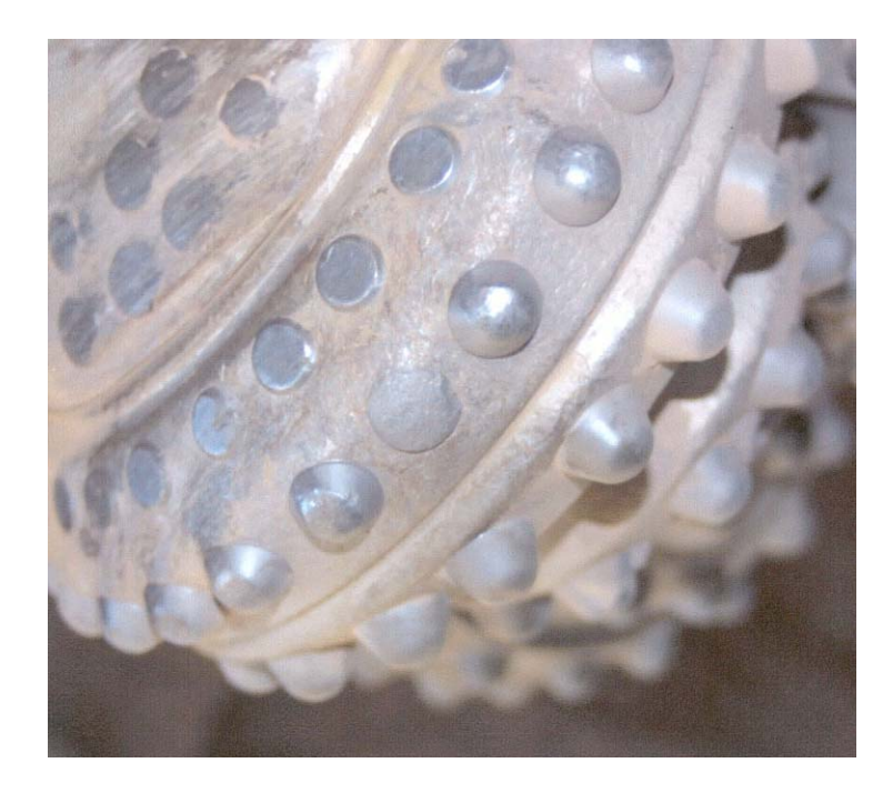
Figure 5. Current Art and Fibrous Monolith Inserts on a Worn Superior Rock Bit. The FM insert in the center has worn more than the current art inserts, although no brittle failures have occurred like the small chip on the insert to the left of the test insert.

However, the pitting failures seen in the hammer tests were similar to the appearance of surface of the worn insert on the drill bit (Figure 6). Together, these wear and failure patterns suggest that FM cell boundaries are at least partially involved in the failure and pre-mature wear.