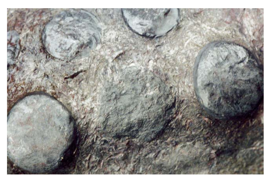
Figure 6. Highly Worn FM Insert on a Worn Superior Rock Bit Drill Bit. Compare the worn insert (center) to the surrounding current art inserts. The two current art inserts at the top exhibit brittle failures. The test insert has similar FM failures as exhibited by the hammer tests in Figure 3.

However, the pitting failures seen in the hammer tests were similar to the appearance of surface of the worn insert on the drill bit (Figure 6). Together, these wear and failure patterns suggest that FM cell boundaries are at least partially involved in the failure and pre-mature wear.