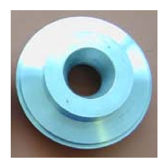
Figure 7. Disc Cutter Pattern Used to Manufacture Discs for Field Testing.

Design and fabrication of the necessary patterns and molds for the disc was begun. The pattern needed to manufacture disc cutters was machined (Figure 7). The patterns needed to manufacture the tungsten carbide core of the disc were also machined.