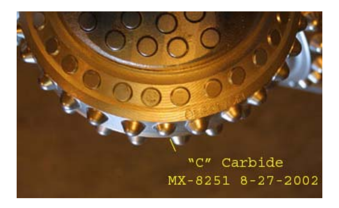
Figure 4. Drill Bit Used in Field Tests. The Superior Rock Bit test bit was 16.5 inches in diameter. The "C" carbide was the new art test insert.

Each test bit drilled in excess of 2,000 feet before the bit was discarded. Taconite is a very hard (generally greater than 50 ksi uniaxial compressive strength) and abrasive rock, which presents a challenging environment for drilling.