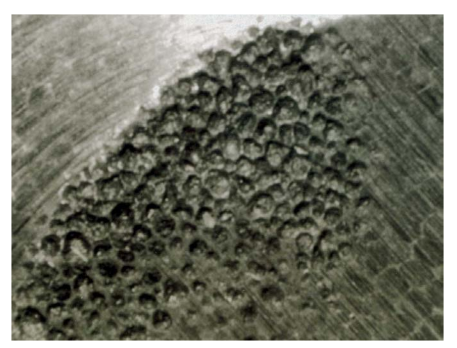
Figure 3. Close-up of the Hammer Induced Damage to the Bottom of the Insert. The damage appears to mostly occur in each fibrous monolith cell. Compare the damaged to the undamaged cells.

One insert was subjected to several blows with a 16 pound hammer. The insert exhibited minor surface damage at the impact points (Figure 3). The damage appears to be related to the cells in the FM structure. The damage appears as pits that are approximately the same size and pattern as the intact cells.