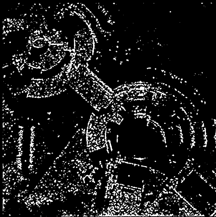
(b) Image from CBP