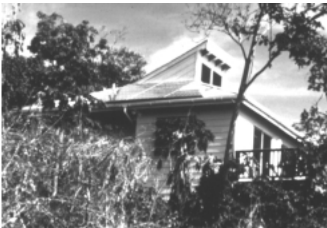
Figure 3. One of the vacation cabins at Harmony Resort on the Island of St. John in the Virgin Islands. The PV unit, which survived Hurricane Marilyn without damage, can be seen on the roof.

Solar hot-water systems and photovoltaic modules are designed to withstand severe environments. PV modules are designed to withstand one-inch-diameter ice balls moving at 23 meters per second (52 miles per hour). 21,22 For maximum survivability, however, solar systems must be attached properly to underlying roof structures using simple but effective techniques that have proven themselves through the years. An excellent example of the survivability of both PV and solar hot-water systems is provided by the Harmony Resort on the