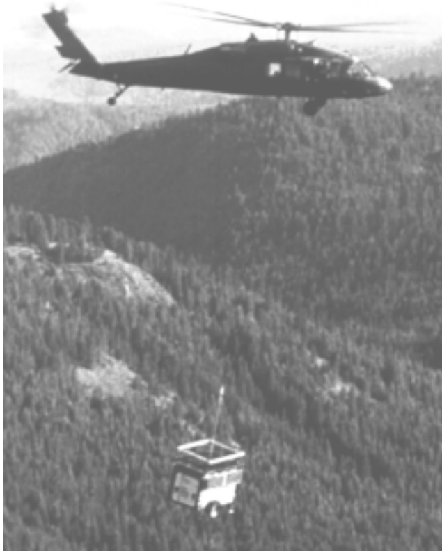
Figure 5. A portable PV genset is helicoptered into the mountains of California.

Since then, PV has been used in a wide variety of emergency management situations. Several companies now make trailer-mounted, PV-powered generator sets (“gensets”) up to about two kilowatts. The energy from PV systems, which can either be pulled by a vehicle or airlifted, can be used immediately or stored in batteries for later use. Some of the gensets even carry a backup propane generator for use in prolonged cloudy weather. A wide variety of PV-powered lights, portable communication systems, and compact, lightweight power supplies capable of recharging the batteries of a laptop computer or cellular phone and other equipment are commercially available.