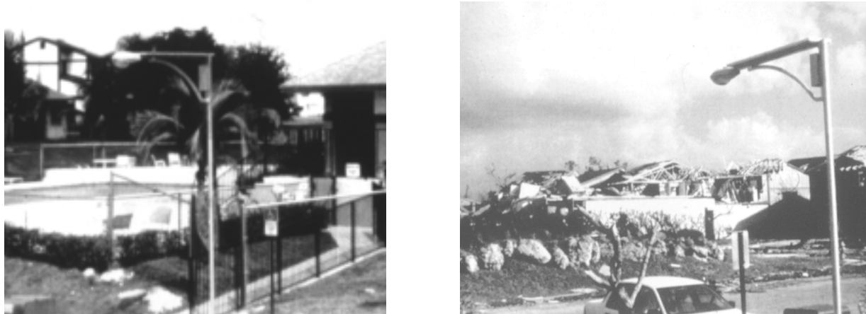
Figure 4. Before and after photos of a PV streetlight in Homestead, a suburb of Miami. Not only were the PV lights the only structures to survive Hurricane Andrew, but they provided the only electricity for several weeks.

An important lesson is provided by one of the PV installations that survived unharmed, but was rendered inoperable because the power line that connected the system to its load was destroyed. Because power lines are very vulnerable to natural disasters, PV is most effective when used as close as possible to the load.