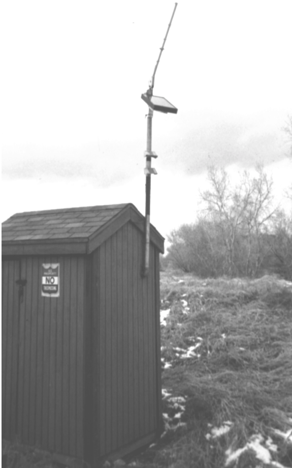
Figure 1. A PV-powered water-level monitor protects the City of Ft. Collins, Colorado, from floods by continually monitoring stream flow and radioing data to the city center. Alarms are triggered if the stream rises to dangerous levels, and emergency response procedures are started.