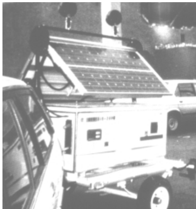
Figure 6. PV gensets come in a variety of sizes that produce up to several kilowatts. This mobile communications and lighting unit was used in the relief effort after the Los Angeles earthquake of 1991.

Many insurers, including the U.S. Automobile Association (USAA) and CNA, already distribute generators to insureds following disasters to reduce the cost of Additional Living Expense (ALE) coverage. By distributing PV generators instead of standard gas