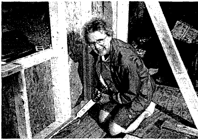
Figure 1 Thorough air sealing, while labor intensive, does not require skilled workers and can easily be done by volunteers.

cut energy bills significantly. The use of energy-efficient windows improves comfort by increasing surface temperatures and reducing drafts. They also limit window/frame condensation, which protects building materials and reduces mold growth. The checklist requires windows to be selected to meet or exceed requirements in the 1995 Model Energy Code . The checklist identifies backer rod (with caulk) as the preferred method for sealing windows and doors into their rough framing. The use of spray foam by inexperienced installers is not recommended because expanding varieties can warp frames, although training can alleviate this restriction.