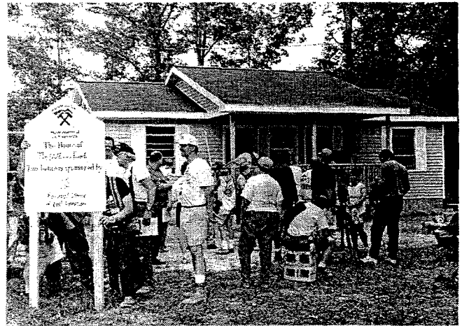
Figure 2 Habitat for Humanity's 1997 Jimmy Carter Work Project provided a good test for the effectiveness of a design and construction checklist aimed at improving energy efficiency in affordable housing.

The Jimmy Carter Work Project (JCWP) is an internationally recognized annual event in which Jimmy and Rosalyn