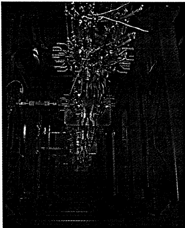
Figure 2. LEDA RFQ assembled in its support frame. A rigid support frame is used to avoid subjecting the OFE RFQ to unnecessary mechanical stresses.

Details of beam simulations [15] and tuning [16] of this four-segment structure are described in the literature. Developments leading up to the successful implementation of tuning a multi-segment RFQ are described [17] earlier. Design and fabrication details of the LEDA RFQ are given in previous publications [18]. The assembled structure is shown in Figure 2. Cooling-water, vacuum, RF power, and instrumentation connections are being made to the LEDA RFQ at this time. This structure should be ready for first high-power conditioning in October 1998.