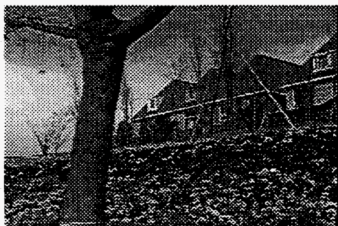
Figure 2. Flower Garden Image

We tested our parallel MPEG decoder for two standard video sequences: “flower garden” (Figure 2) and “tennis” (Figure 3). The testing result are summarized in Table 1. Note that the time is an approximation based on a segment containing GOPs with six frames. The testing was conducted in the system environment described in Section 3.