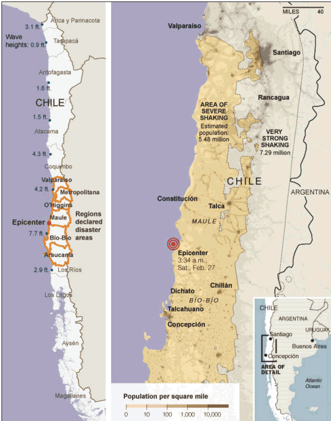
Figure I. Chile: Regions Affected by Earthquake