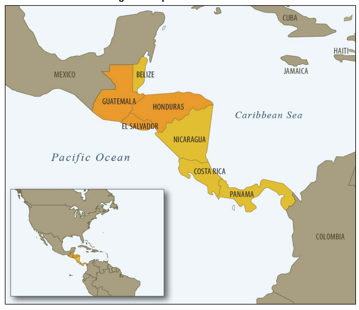
Figure 2. Map of Central America