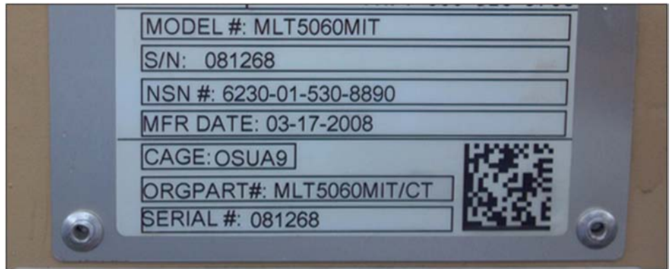
Figure 1: Data Plate with IUID Data Matrix