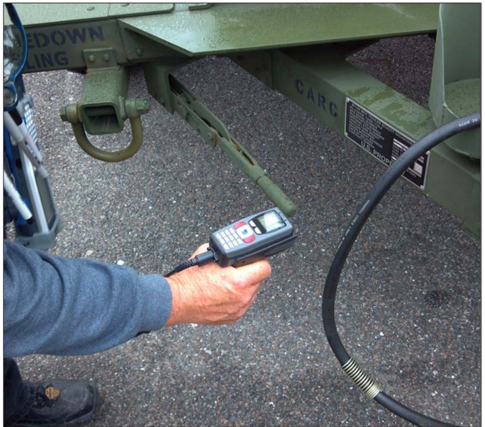
Figure 2: Electronic Scanner Being Used to Read a Data Plate with an IUID Data Matrix

There are several types of tools that can be used for this process, including hand-held scanners and web-based software that can read an image of a data matrix. Because data matrices cannot be read visually, electronically reading the matrices is the only way to access the UII data they contain. Figure 2 shows an electronic scanner being used to read a data plate with an IUID data matrix.