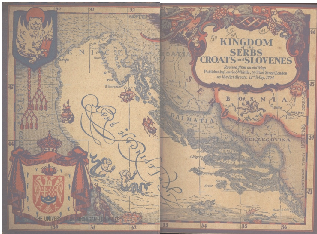
Figure 1. Lester Hornby, Map of the Kingdom of Serbs, Croats & Slovenes, 1927 105

eighteenth century map of the Balkans bearing words ‘revised from an old Map.’ The map depicts the physical landscape of Southeastern Europe, as well as the borders between the regions Bosnia, Herzegovina, and Croatia. Importantly, the map also contains illustrations of bare-breasted mermaids frolicking in the western Adriatic. In the eastern portion of the map, giant winged fish swim near the Balkan coast. The northeastern corner depicts the Greek god Zephyr blowing wind across Bosnia, while a Turk on horseback appears to raid the Dinaric Alps.