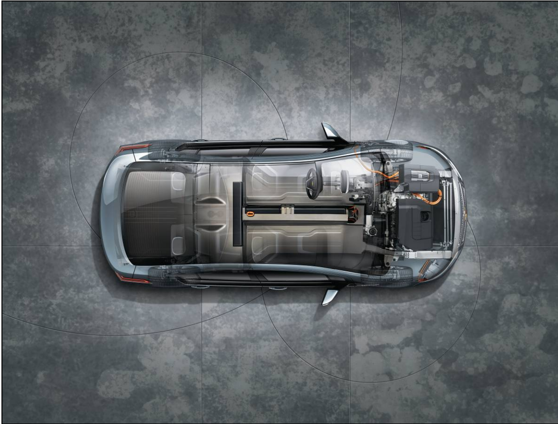
Figure B-1. Overview of the GM Volt