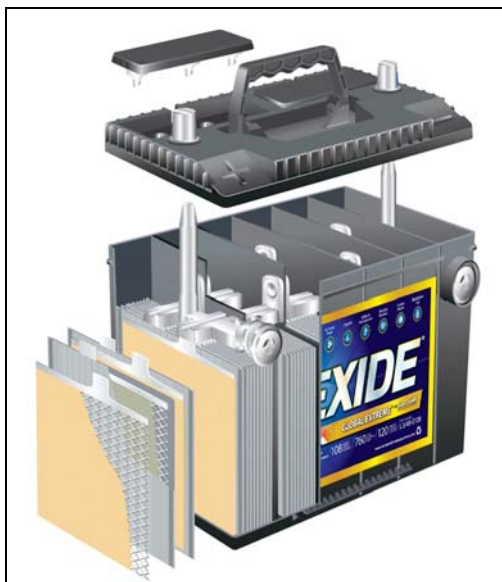
Figure 2. The Lead-Acid Battery Showing Internal Components