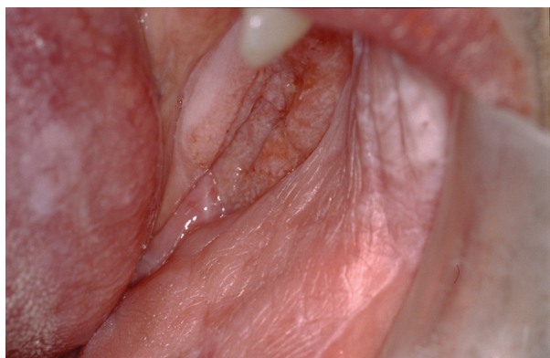
Fig. 4. The same patients, ten years after initial diagnosis of OLP and two years after fast-growing multifocal and verrucous, showing the clinical appearance of squamous cell carcinoma in the gingiva and left lower buccal sulcus. She also presented plaque OLP in gingiva, buccal and dorsum of the tongue.