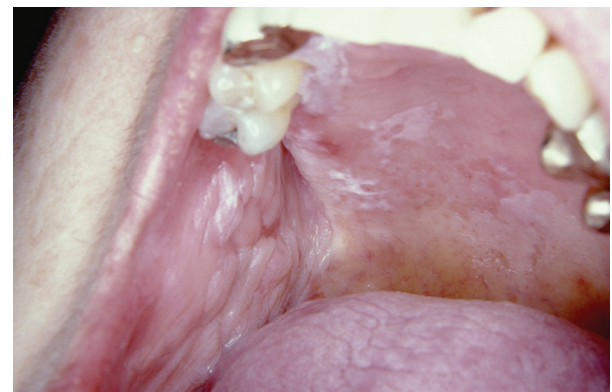
Fig. 1. Reticular, plaque and atrophic type of lichen planus in hard palate, and reticular-erosive in buccal mucosa at the moment of diagnosis.

Hyperkeratosis (parakeratin and or orthokeratin) was present in part of all specimens, acanthosis and papillomatous squamous proliferation partly in ten cases, and verrucous hyperplasia in nine cases. Four patients (28.5%) went on to become malignant, three cases of squamous cell carcinoma (SCC) were well-differentiated, and one verrucous carcinoma. The mean time to malignant transformation from the first diagnosis was 9 years. Three cases were female and one male. The most common location of carcinoma was attachment mucosa (Fig. 4), gingival and hard palate.