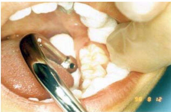
Fig. 3. Use of metallic saliva ejector.