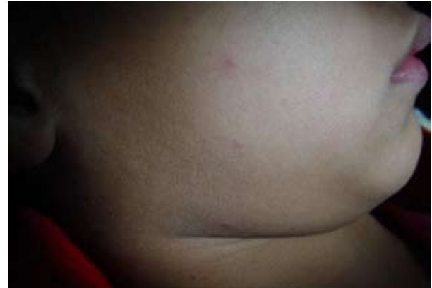
Fig. 4. Skin reaction after latex contact.