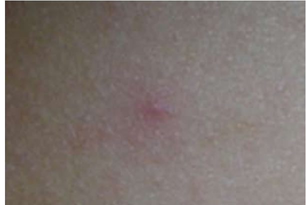
Fig. 5. Reaction after latex contact, in spite of laboratory exams negative for NRL allergy