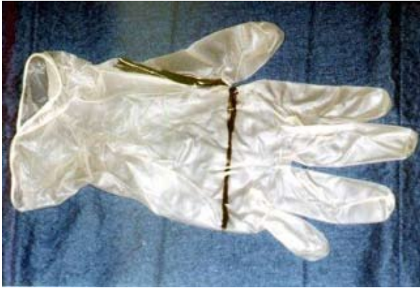
Fig. 1. Vinyl glove used for dental treatment.