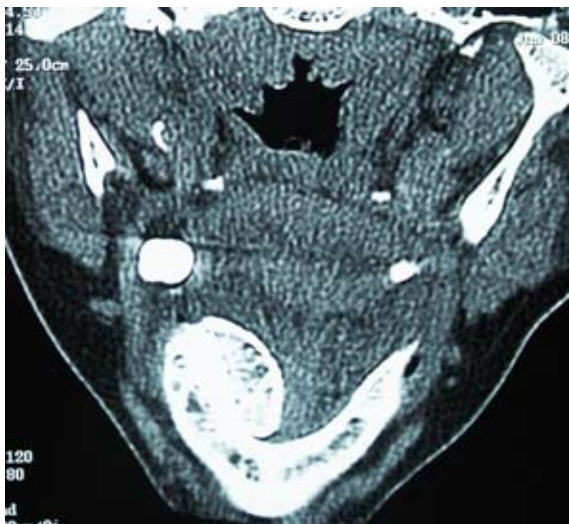
Fig. 2. CT scan of lesion on the left mandible.