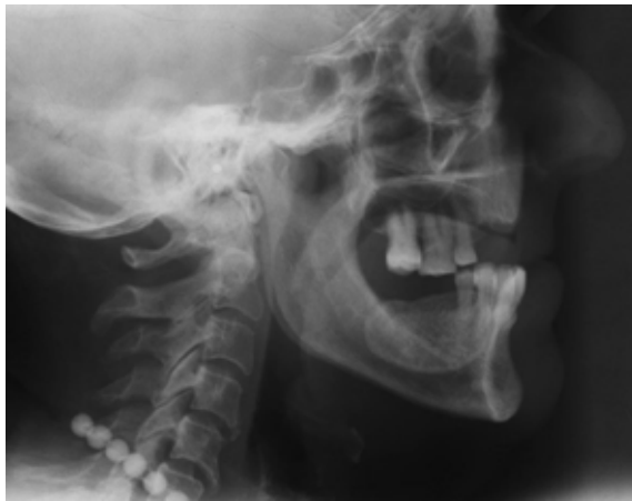
Fig. 1. Lateral skull radiography of the lesion on the left mandible.

Osteoma is a bone lesion characterized by proliferation of compact, cancellous mature bone cells or both (1-3). It is debatable whether osteomas are a benign neoplasm or a hamartoma type lesion (1). In general, osteomas grow slowly and progressively (1-3) and are categorized as central, peripheral or extraskeletal according to location (1-5). Clinically, peripheral osteomas (PO) are unilateral, sessile or pedunculated and have mushroom-like lesions ranging from 10 to 40 mm in diameter (2-4). They appear radiographically as well-circumscribed radiopaque masses that appear round or ovoid in shape (1,2,4). Osteomas affecting the mandible are rare (1-3). Few cases reported in the literature reached the size of the presented case (2,3). In this report, we presented a gigantic PO invading the lingual part of the left mandibular corpus.