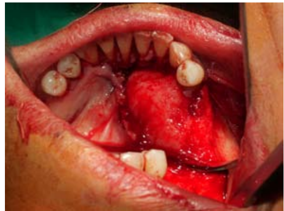
Fig. 3. Intra-operative view of the lesion.

A full-thickness subperiosteal flap was reflected intraorally via circular incision under local anesthesia. An excisional biopsy was performed using rotary instruments and a bone chisel. The cortical bone of the mandible was shaped and smoothed before closing the flap (Fig. 3). A microscopic evaluation of the specimen showed no