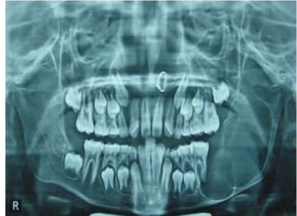
Fig. 2. Panoramic radiogram revealed a large multilocular radiolucent area extending from the left first molar to the left coronoid process including the left ascending ramus area. Permanent maxillary and mandibular canines and premolars are seen below the deciduous teeth.

Panoramic radiography showed a large multilocular radiolucent area occupying the left mandible from the first molar tooth to the neck of condylar process and the coronoid process including the left ascending ramus area. Root resorption was observed in the first molar. The base of the mandible and the anterior border of the ramus was damaged and thinned (Fig.2).