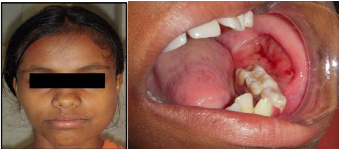
Fig.1. A) Extra oral view shows swelling on left side of face; B) Intraoral view shows obliteration of left buccal vestibule

The histopathological processing of the tumor revealed a plexiform ameloblastoma predominantly composed of epithelium arranged as a tangled network of anastomosing strands. The cords or sheets of epithelium are bounded by columnar or cuboidal ameloblast like cells surrounding more loosely arranged epithelial cells. The