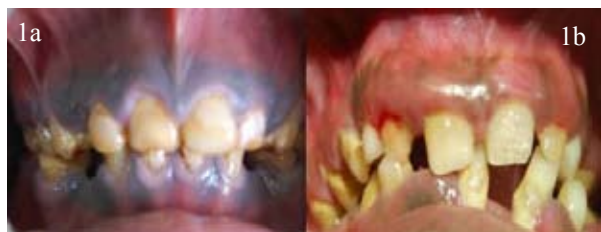
Fig.1. a. Multiple missing teeth (13,23,33,43,34,44,45,17,27,37,47) and anterior deep bite of 3mm and chipping of enamel.