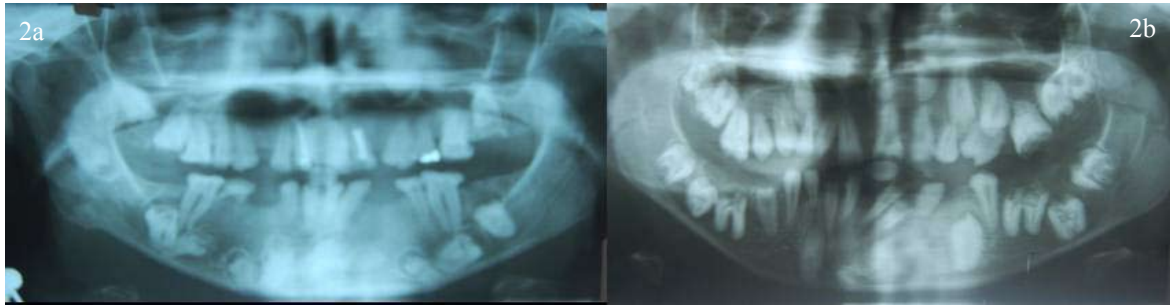
Fig. 2. a. Panoramic radiograph showing multiple impacted teeth (13,23,33,43,34,44,45,17,18,27,28,37,38,47,48). The follicular spaces of 16,17,27,37 and 38 were enlarged and measured about 8-10mm.

b. Panoramic radiograph showing multiple impacted teeth (13, 23, 33, 43,17,27,37 and 47) and supernumerary teeth in relation to 15 and 25. Enlarged follicular spaces measuring about 3-4 mm in relation to 13,23,33,43,17,18,27,28,37,38,12,22,34,44 and 45. Inadequate root formation and taurodontism (17, 18, 27, 28,37,38,47 and 48) and pulpal calcifications (25, 37, 38, 47 and 48).