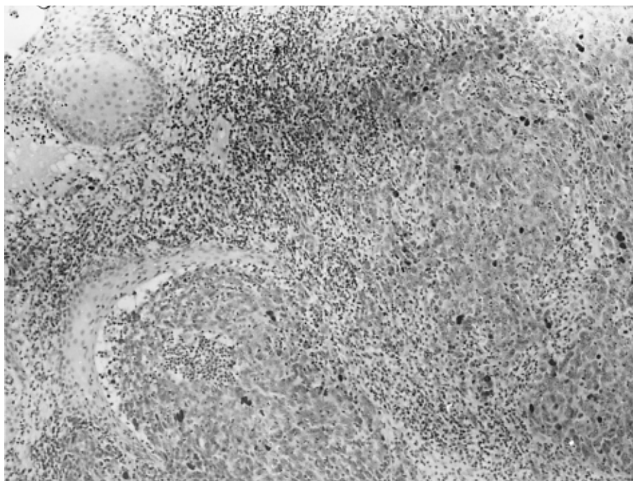
Fig. 1. Intense p53 immunostaining observed in the nuclei of some tumoral cells in an undifferentiated carcinoma case (UCNT) (200 \times ).

method was used to assess differences between angiogenesis in relation to clinicopathological variables and p53 expression. A Chi-square test with Fisher's correction was used for categorical variables to analyze the associations between p53 expression and clinicopathological variables. At the least, a Cox multiple regression survival analysis was done to determine the best independent prognostic indicators in NPC patients. A p value less than 0.05 was considered significant [1, 13].