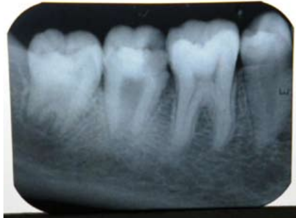
Fig. 1. Preoperative radiograph

A 15-year-old male patient complained of pain in relation to the left mandibular posterior region, especially after consuming hot drinks. Medical history was non-contributory. Intraoral examination revealed deep caries. The tooth was also tender on percussion. Intraoral periapical radiograph of the tooth revealed deep caries approximating the pulp with associated periapical pathology and open apex (Figure 1). Vitality test for heat and cold were negative. A detailed examination of the radiograph revealed the presence of a single root with a wide canal. Therefore c-shaped canal configuration was anticipated. To confirm this unusual morphology, it was decided to perform CBCT imaging of the tooth. An informed consent was obtained from the patient, and a multislice CBCT scan was performed. The involved tooth was focused, and the morphology was obtained in transverse, axial, and sagittal sections of 0.5-mm thick-