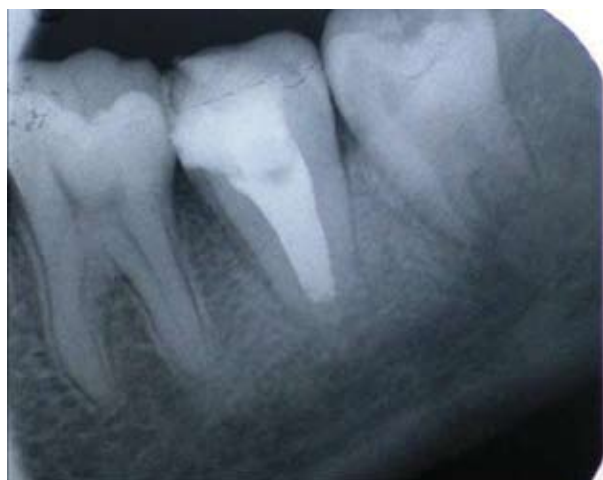
Fig. 3. periradicular healing evident after 18 months

The clinical follow-up at 18 months showed the patient functioning well with no reportable clinical symptoms and an absence of any sinus tract formation. The radiographic follow-up (Figure 3) showed complete healing of the periapical radiolucency and regeneration of the osseous periradicular tissues.