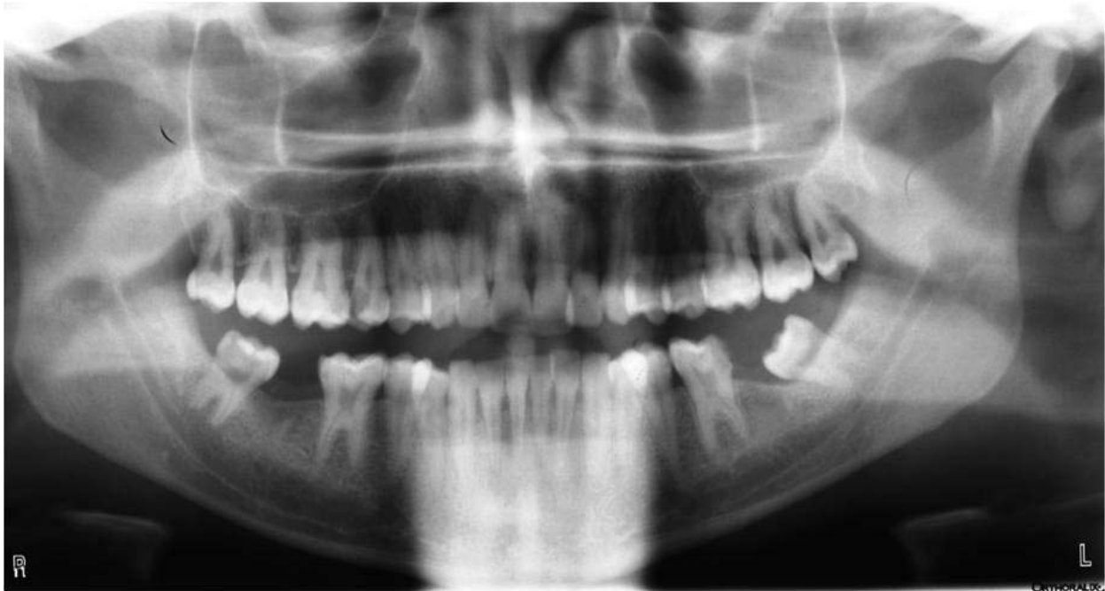
Fig. 2. Taurodontism in the upper and lower molars