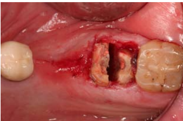
Fig. 1. Intraoperative image following surgical sectioning of the second lower left molar and appearance of the subcutaneous emphysema.

During the sectioning procedure (Fig. 1) the patient reported a swelling of the face with mild upper neck pain on the same side. An immediate swelling was observed of the upper and lower cheek and lower left eyelid, accompanied by audible and palpable crepitus.