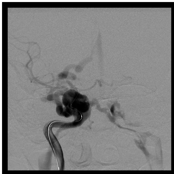
Fig. 1. AP head arteriography. CCF before treatment with endovascular approach.

After evaluating the case, Neuroradiologists decided to carry out a bilateral arteriography of the head. This test also proved the existence of a direct posttraumatic CCF. In addition, this test also showed that the fistula presented high blood flow, with significant impact on intracranial hemodynamics (Fig. 1). Against this backdrop, neuroradiologists decided to treat the patient with endovascular approach. More in detail, they carried out a right cavernous sinus embolization with arterial access. In fact, through Seldinger technique (femoral approach) they performed the embolization of the lesion using 12 endovascular coils. In this sense, we would like to stress that the surgery was highly successful (Figs. 2,3). In fact, chemosis and pulsating exophthalmos of the right eye completely disappeared after surgery. Moreover, the patient referred improvement of visual acuity. Importantly, we also want to emphasise that the patient remained asymptomatic after 9 years of clinical monitoring.