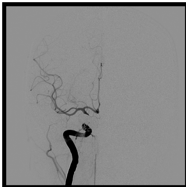
Fig. 2. AP head arteriography. CCF after treatment with endovascular approach.