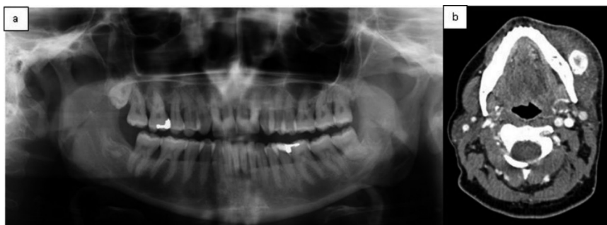
Fig. 2. Radiological study. a) orthopantomography. b) CT scan: well-defined calcification located within masseter muscle.