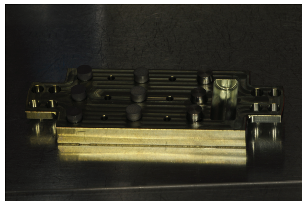
Fig. 1. Titanium discs with turned, sandblasted/acid-etched and titanium plasma sprayed surface inserted on a metallic holder and treated in the argon plasma chamber.

tained from a healthy male donor, who had not assumed any medication for 3 months prior to the study. The protocol was approved by the Ethics Committee and a specific informed consent was signed by participants. After 24 hours, a half of the contaminated discs (control group) were washed three times with PBS to remove the planktonic and loosely attached bacteria and transferred to a 15 ml Falcon tube containing 1 ml of PBS. The tubes were sonicated for 1 min at 100% intensity for the disruption of the biofilms. Sonication fluid was diluted and all serial dilutions were then used to evaluate the colony forming units (CFUs). The other half of the contaminated discs (test group) were inserted on a metallic holder and treated in an argon plasma chamber (Plasma R, Sweden & Martina, Padua, Italy) for 12 minutes at room temperature (Fig. 1) prior to be washed, sonicated and analyzed for CFU counting as above mentioned. All assays were performed using triplicate samples of each material in 3 different experiments.