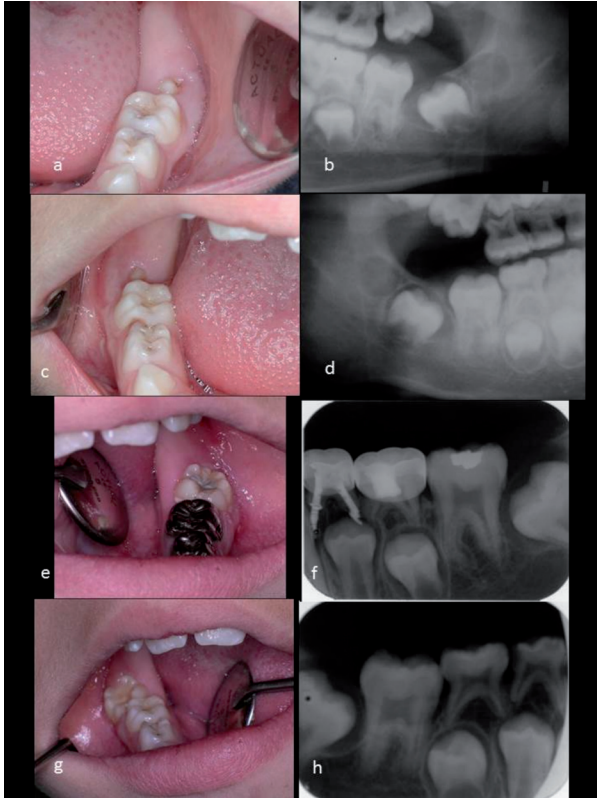
Fig. 2. A to D: Follow up, three months after the first surgical intervention. a) Intraoral image section 30. b) Radiograph of section 30. c) Intraoral image section 40. d) Radiograph of section 40. E to H: Follow up, two years after the first surgical intervention. e) Intraoral image section 30. f) Radiograph of section 30. g) Intraoral image section 40. h) Radiograph of section 40.

In the one and two year follow ups (Fig. 2e-h), it was noted that the eruptive process continued normally. Only a slight misalignment, caused by the appearance of both cysts, of the permanent second molars was noted. This could be resolved by your orthodontist. Molars are essential and their development completely normal.