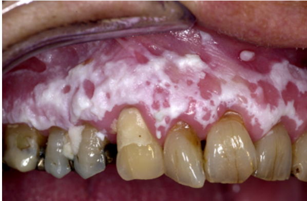
Fig. 2. Leukoplakia (or “frictional keratosis”?) in a 57-year-old woman.

Another possible reversible white lesion is the frictional lesion caused by mechanical irritation, e.g. vigorously brushing of the teeth (Fig. 2). This lesion is sometimes