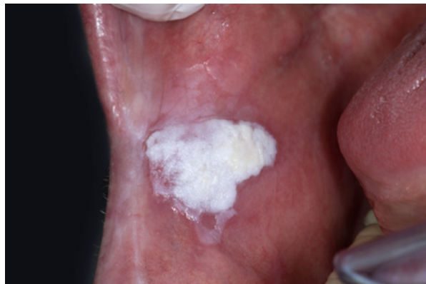
Fig. 6. Non-homogeneous, verrucous leukoplakia. In spite of a homogeneous white appearance and a homogeneous verrucous texture, this lesion should not be called homogeneous leukoplakia