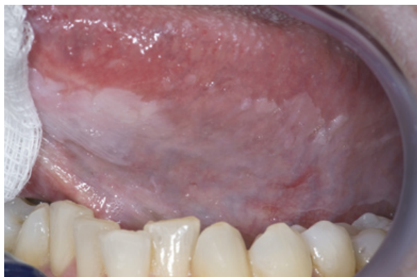
Fig. 3. Homogeneous (flat and thin) leukoplakia in a 53-year-old man.