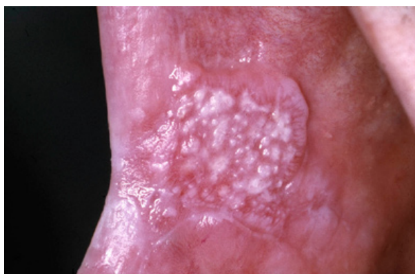
Fig. 5. Non-homogeneous, nodular, leukoplakia in a 61-year-old man.

In fact, a diagnosis of PVL can only be made in retrospect. In several of such cases the initial lesion may just be a solitary homogeneous or non-homogeneous leukoplakia (13). Unfortunately, in many scientific reports on PVL just multifocality and involvement of the gingiva seem to have been used as diagnostic criteria without paying attention to the history of the disease.