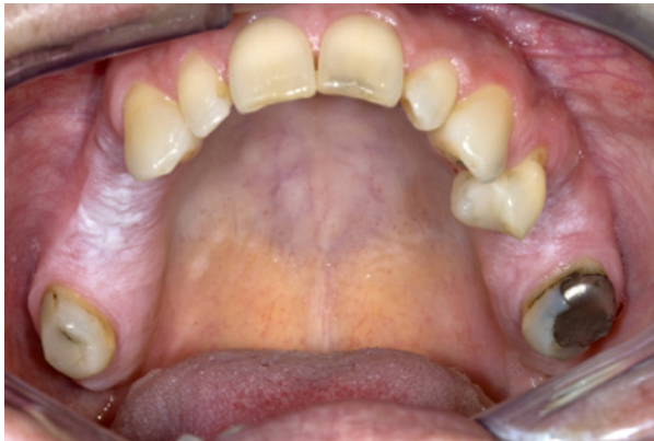
Fig. 1. Leukoplakia (or "benign alveolar ridge keratosis"?) in both sides of the maxilla in a patient who never smoked and has not been wearing a partial denture.

Although various international meetings on the subject of oral leukoplakia have been held between 1978 (WHO) and 2005 (WHO) no substantial changes in the definition of leukoplakia have resulted from these meetings.