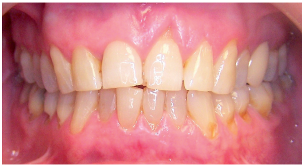
Fig. 1. Clinical examination: intraoral frontal view.

lengths and IPL sources were used during the procedure (650 nm cut-filter, Lovely, Alma, Israel and 695 nm cut-filter, Quantum, Israel). The patient referred that from the fourth IPL treatment session, she started suffering severe (8/10 on a Visual Analog Scale (VAS)), constant pain and numbness localized at the anterior hard palate, the upper central incisors, the buccal side mucosa and sub-nasal area. She reported that non-opioid analgesics such as ibuprofen were unsuccessful in controlling the pain. During the initial visit at our unit, the patient signed an informed consent to be attended there, underwent a thorough anamnesis and clinical examination that included panoramic X-rays (Figs. 1,2) and periapical radiographs