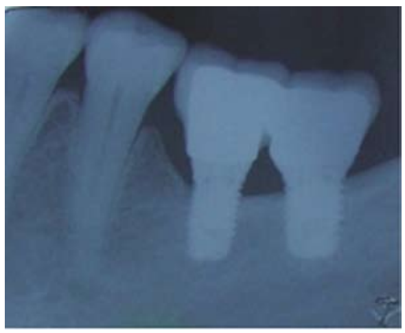
Fig. 3. Radiograph 5 years after treatment of two splinted short implants.