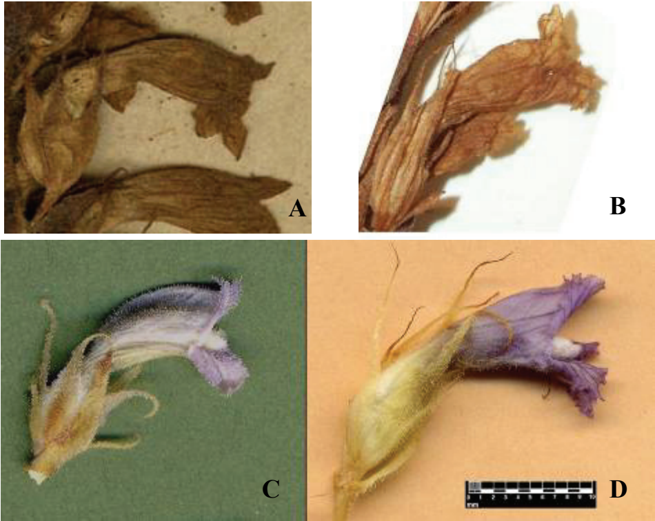
Fig. 5.- Lateral views of calyx and corolla. A. close-up of the type of Phelipanche cernua (see fig. 1). B. close-up of the type of Phelipanche schultzei : Annaba, Algeria [herb. Mutel, MHNGr. 1849 (GRM)]. C. Ph. cernua from San Martín de Ubierna (Burgos, Spain) 42° 28' 39'' N 3° 41' 38'' W, 918 m, parasitic on Lactuca viminea (L.) J. & C. Presl in limestone and grassy slopes, Ó. Sánchez Pedraja & M. Tapia Bon SP0035/2007, 23-VI- 2007 (herb. Sánchez Pedraja 12919). D. Ph. schultzei from the bed of the stream Breña (near Alhaurín de la Torre, Málaga, Spain), 36° 38' 53'' N 4° 10,67 m 41'' W, 250 m, parasitic on Distichoselinum tenuifolium (Lag.) García Martín & Silvestre, G. Gómez Casares & G. Moreno Moral MM0060/2004, 12-IV-2004 (herb. Sánchez Pedraja 11774). The graphic scale is strictly referable only to the two lower pictures.