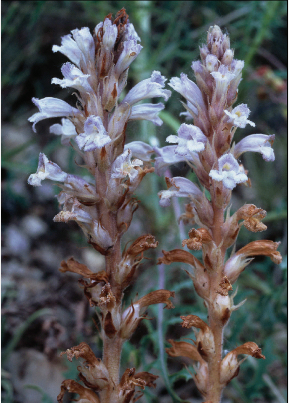
Fig. 4.- Phelipanche cernua Pomel. Photograph in vivo of the plants in the fig. 2.