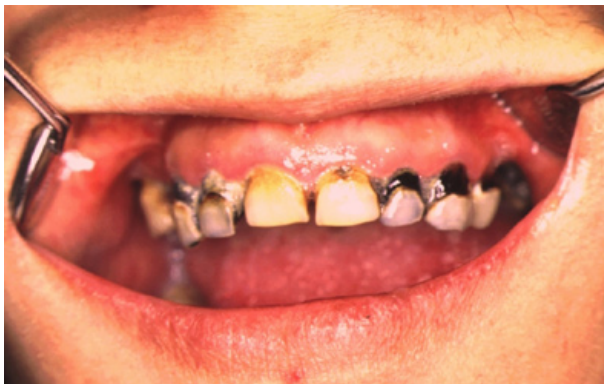
Fig. 1. A clinical case of initial “meth mouth” in a young drug addict.