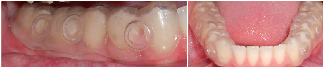
Fig. 2. Clinical images of the “split-mouth” design of the IDODS. Note that the lower incisors are kept uncovered to improve aesthetics and comfort.

The IDODS design was modified during its use in this research. The most significant change was the ‘split-up design’ (Fig. 2). With this enhancement, the splints were more comfortable for volunteers in their normal life because their lower incisors were not covered. At the same time, this design facilitated the removal of the disks on the day of the sample analysis, preventing the unnecessary removal of the homologous splint.