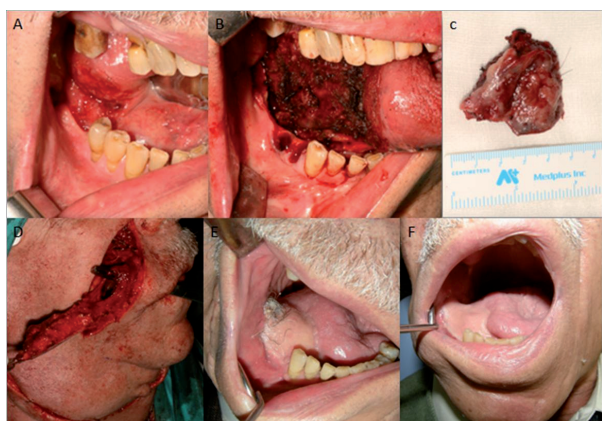
Fig. 1. A) Ulcerative lesion in right glosso-mandibular sulcus and right lateral lingual border. B) Intraoperative image after intraoral resection of the lesion with wide margins. C) Surgical specimen. D) Intraoperative image showing nasolabial flap design. Transbuccal tunnel allows the flap to be transferred into the intraoral cavity. E, F) Postoperative images before and after radiotherapy treatment.

tunneled, de-epithelialized and sutured in its final position as a single-stage procedure. All traces of intraoral hair disappeared following the patient's postoperative radiotherapy, which resulted in a satisfactory aesthetic outcome (Fig. 1). At present the patient is still being followed up and shows no signs of relapse.