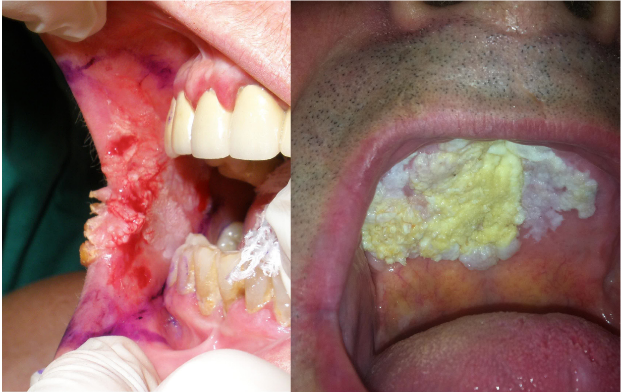
Fig. 2. Different localizations of OVC. Left: Buccal mucosa (patient #11). Right: Hard Palate (patient #7).

involvement of the lower lip (15,16), alveolar ridge and gingiva (3,17). The presence of a previous leukoplakia is also a constant (2-5,12,13). Some authors report diagnoses like verrucous leukoplakia (17) or verrucous hyperplasia (18) in biopsies of long standing leukoplakia in which an OVC appeared later. In our study we found n = 7 OVC patients with previous verrucous leukoplakia in which subsequent biopsies were performed, with histopathological diagnoses similar to those described before. All our patients were treated by surgery. Local resection with 1 centimeter of clinical margin is considered by many authors (19,20) as the treatment of choice for verrucous carcinoma. Although clinical margins were even greater than 1 cm, due to tissue retraction, histological margins were closer to the tumor. However, histological margins above 5 mm were considered sufficient to not increase the risk of local recurrence (21). In patient #4, due to its closest free margin (1 mm) and the impossibility to increase resection margins in a second surgery, received postoperative radiotherapy.