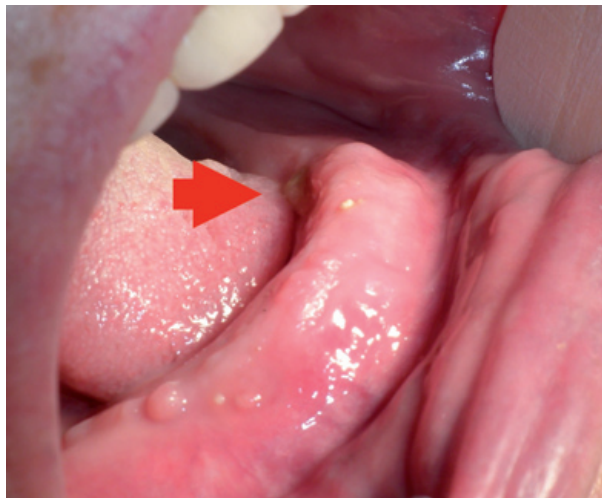
Fig. 3. Case B3. Asymptomatic bone exposure after 7 months of treatment with teriparatide.

a series of 8 patients treated with platelet-rich plasma and leucocytes (Smart PReP®) showing an improvement of their lesions after a month with the treatment and also without bone exposure after 14 months. According to these authors, at least 2 of the 19 cases published with this treatment did not show any improvement, but the type of product employed is not uniform and the control time is often too short (less than 6 months). Very recently, Mozzati M et al. (14) have published an interesting essay that claims a 100% of success (complete healing) in 32 patients with chemical osteonecrosis, 24 of them in the mandible. Control time in the study was around 48-50 months. These authors used the technique described by Anitua, which also documented a BRONJ case treated successfully with PRF (21). Our observations show satisfactory results too although we had less cases and we used PRF. Moreover, it is important to note not only four of our patients treated this way had had been previously treated with surgery without success, but also three of the patients successfully treated with PRF wore more than one year of evolution of their BRONJ.