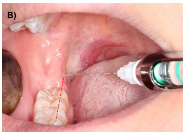
Fig. 2. B) Modified IANB using a lower injection location.

A possible way to decrease the incidence of these events is to change the injection site to a more inferior position, since the needle tip would be in a location where the neurovascular bundle would be inside the mandibular canal, therefore avoiding direct contact with the vascular structures. Thus, using a modified Halsted technique with a slightly inferior injection height (at the occlusal plane level) would probably reduce positive aspirations without significantly compromising the efficacy of IANB (Fig. 2). For this reason, the authors decided to perform a clinical trial with the aims of comparing the efficacy and the complication rates of these two IANB techniques.