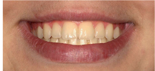
Fig. 2. Photo of smile with 0° occlusal canting.